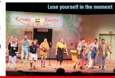
Lose yourself in the moment

Each cast member is an important member of this hilarious, heartwarming musical.