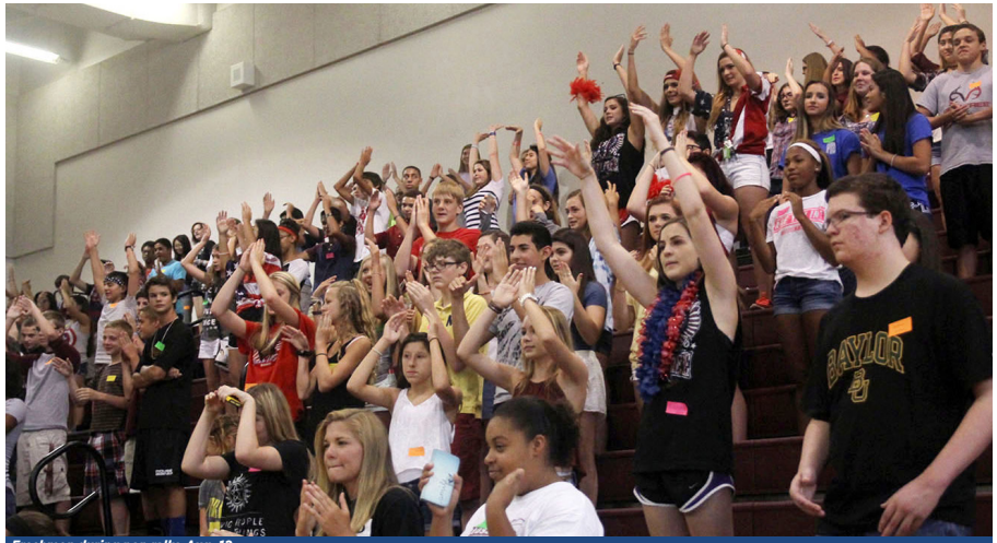
Freshmen during pep rally, Aug. 12