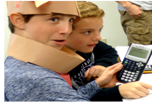
- Chase Camp (8)

'Next, I eat breakfast. I normally eat eggs or cereal.'