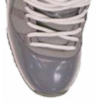
Model: Retro 11 Colorway: Cool Greys Retail: $175