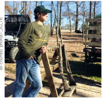
all courtesy photos 1.30.16