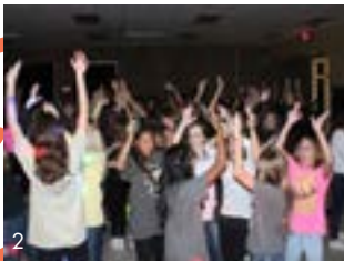
2. Students throw up their hands at the spirit dance to the song "All I Do Is Win."

Highlights of our lives? We've got 'em. 'Merica Monday. The Halloween pep rally where Star Steppers and Cheer couldn't be found...until they surprised us in clown dresses and painted faces. Sixth grade boys asking the eighth grade girls to dance at the spirit dance. Cramming for tests in the gym before school. Student Council trips to help Pre-K with valentines. Jumping for cash as a reward for perfect attendance. And we are just getting started.