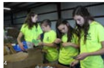
4. Student Council members separate glasses during a field trip to Harvest Texarkana.