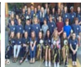
5. Eighth graders gather at Amigo Juan's for their traditional pre-homecoming meal.