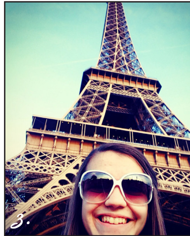
3. Photo contributed by: Savannah Shaw