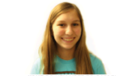
WHAT DO YOU HOPE TO GAIN IN HIGH SCHOOL?

When I look back on high school, I want to remember all of my friends and the memories of the fun times we had together, because those were the best times.