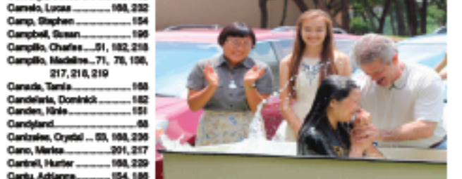
WHAT IS THE CENTER OF YOUR LIFE?

The center of my life is my faith. Even though it hasn't always been a part of my life, I value it so much. Everything in my life has just fallen into place ever since I applied faith to my actions. All of my accomplishments and my triumphs, I have God to thank for them.