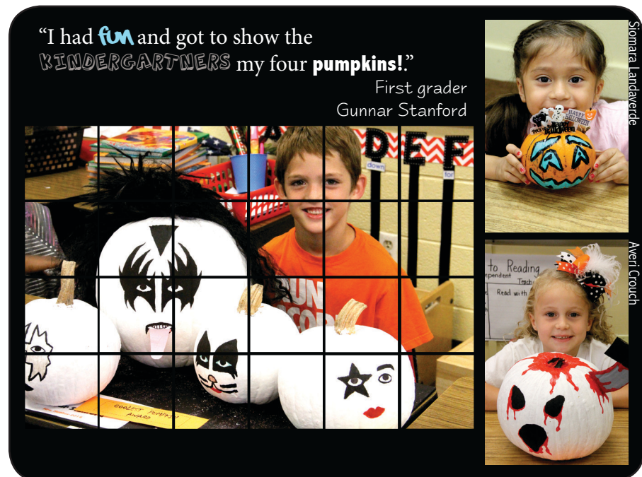
dress up page by hannah

Another fun activity allowed students to test their creative skills decorating pumpkins. Some of the favorite designs included the KISS band members and of course, some scary characters.