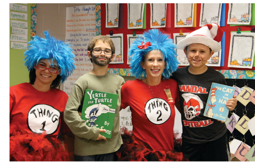
Students and teachers welcome the fun of Dr. Seuss.