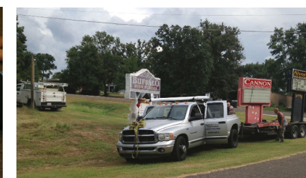
A new look. The entrance to the high school from Highway 164 received a new sign at the beginning of the school year. The sign was donated by Community National Bank.