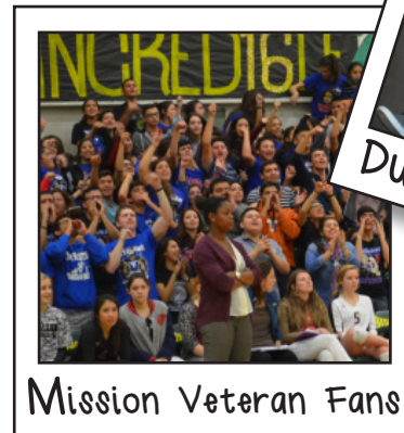
Mission Veteran Fans