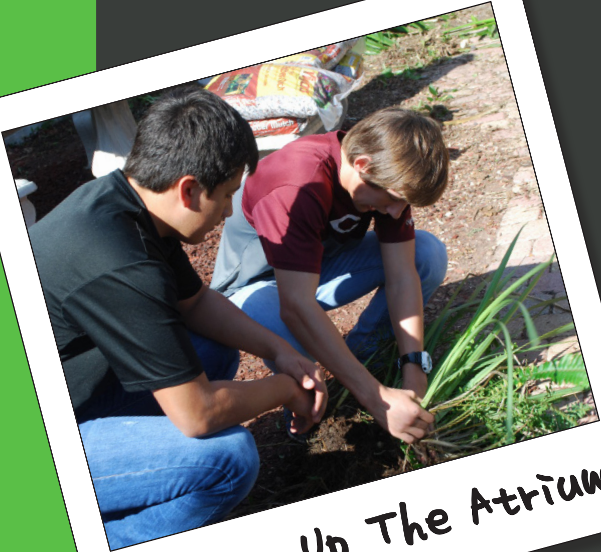
Sprucing up The Atrium