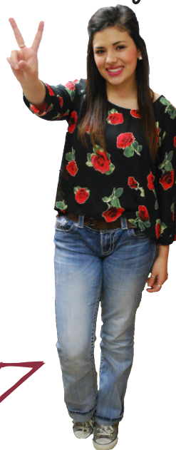
Editor In Chief