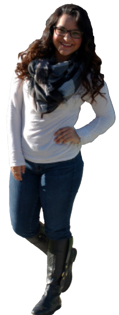
Editor In Chief