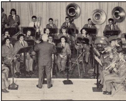
The East Bernard High School band performs at their annual concert for the town to showcase their hard work.