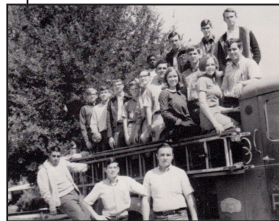
The Fire Drill team poses for their picture, ending another successful year of keeping students safe.