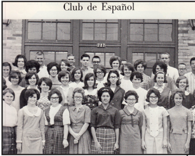
Members of the Spanish Club, or Club de Español, pose in front of the school for the annual group picture.