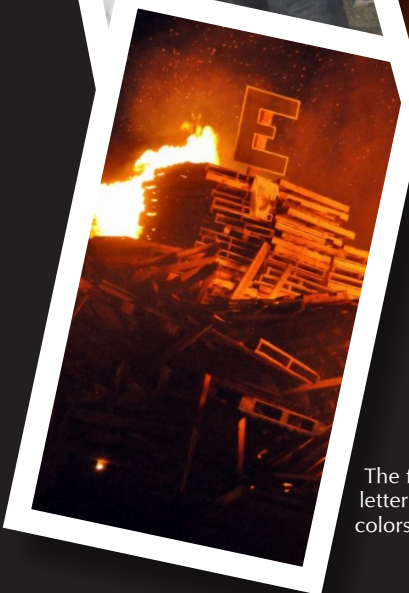
The flames surround the initial letter painted in Eldorado's school colors.