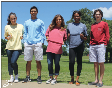
3.