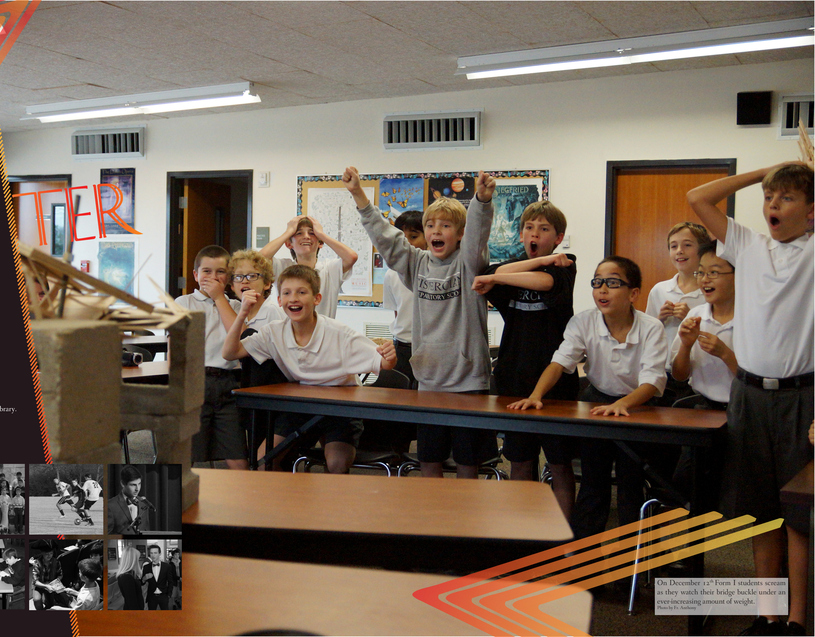
On December 12 th Form I students scream as they watch their bridge buckle under an ever-increasing amount of weight.