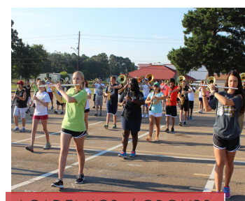
ACADEMICS / GROUPS