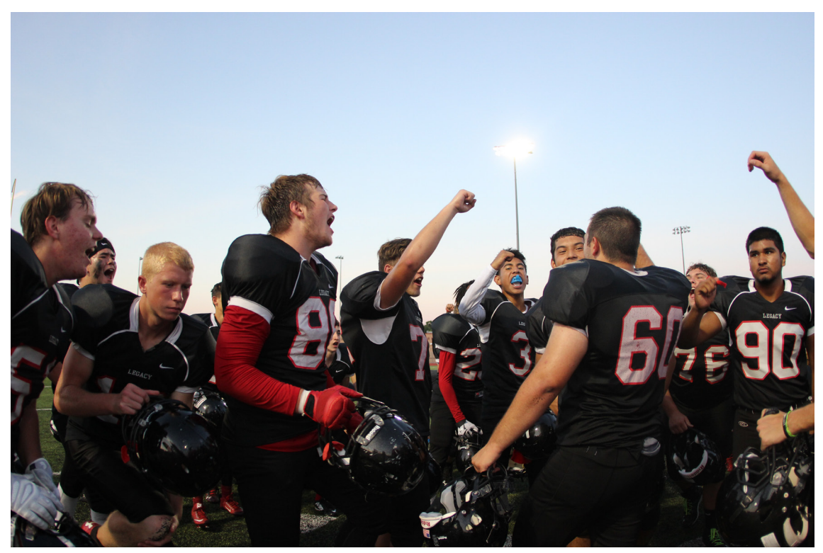
The JV football team celebrates after a win against Crowley. The Broncos beat Crowley 19-0.