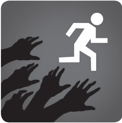
Zombies, Run! by Six to Start

For those who don’t drink enough wa-ter or are looking to get better about the healthy habit, this app is for you. Adorably beneficial, the app provides its user with a plant to take care of, or “nanny”, and every time you water yourself, you water it, too! If you don’t water your plant, it will get sad and sick and eventually pass away, so you’re given the responsibility of a vir-tual life. Surprisingly, it actually seems to help improve daily water intake, because with time the user can unlock new plants and pots to put them in and then watch the plants grow. And no one wants to watch a cute little plant slowly wither away.