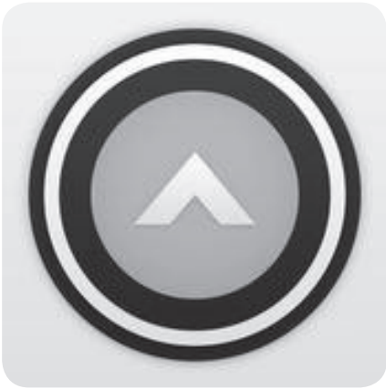
CARROT by Grailr LLC

You’re running, collecting supplies and following along to the story in your headphones when all of a sudden you hear the snarling of zombies behind you and a voice in your ear telling you to run. Zombies, Run! is a fitness app with a plotline in which you play the hero who sets out to complete missions and survive the zombie apocalypse. While running, users follow along with the episode and do as instructed to get ahead and escape zombies. If they survive the episode, they are rewarded with the supplies they picked up along the way to help support their home base. Overall, the app provides a fun twist to the some-times tedious act of running and helps push users past their limits.