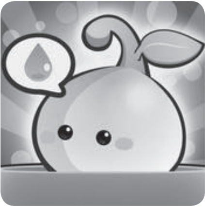
Plant Nanny by Fourdesire

Free Available on the App Store, Google play and the Windows Phone.