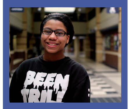
"You never really know what someone is going through, so it's always good to give that positive vibe energy."