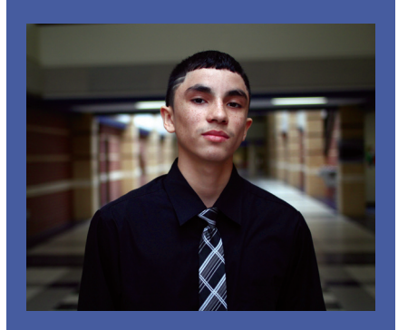
"It's the right thing to do."